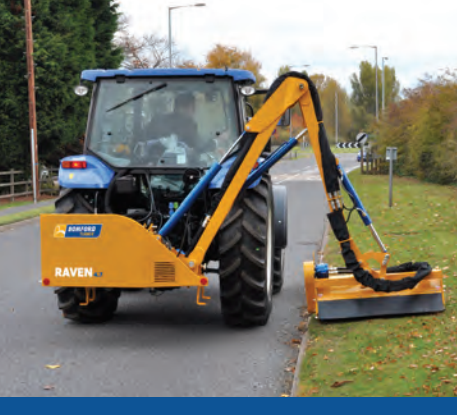
Rugged design With oversized arms this machine is perfect for cutting grass.