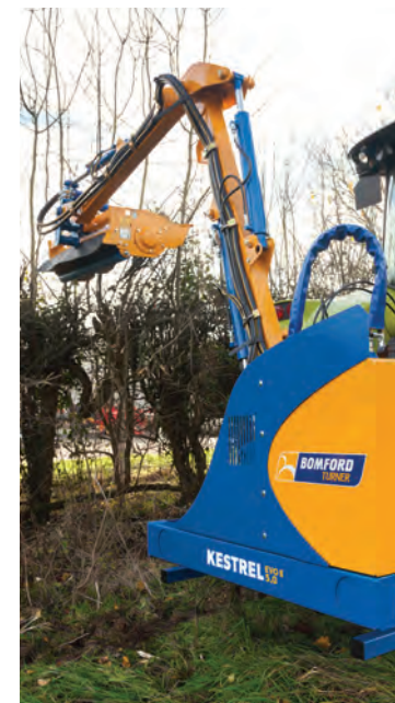
1257LW head Perfect for smaller light weight tractors.