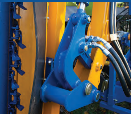
240° cowl bracket linkage For a greater angle range.