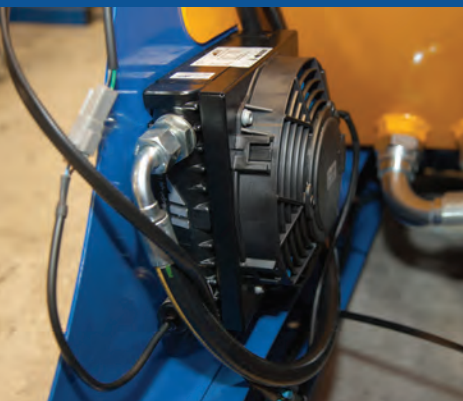
Optional oil cooler Can be fitted in rear panel.