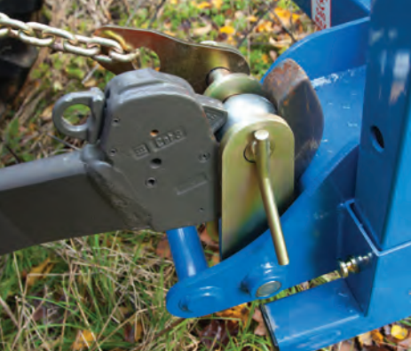
Mechanical breakout For machine and operator safety.