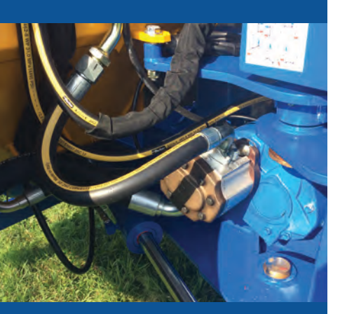
Powerful 74hp hydraulics For continuous use. Twin pumps with separate oil tank.