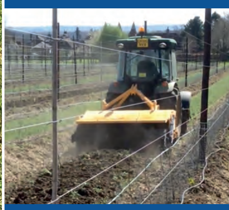
Vineyard 1.6m option

Tines lift soil and turns into rear rotor to break down soil structure.