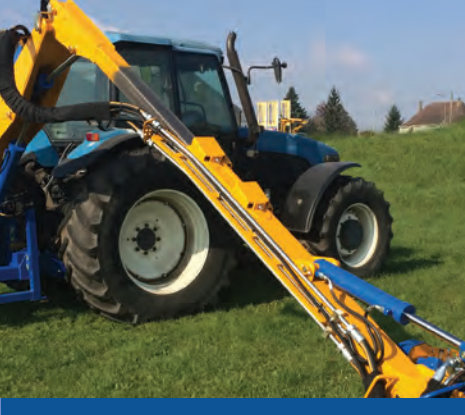
Telescopic arm Gives increased flexibility.