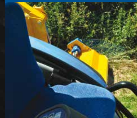
Clear visibility Variable forward reach brings cutting head into drivers view.