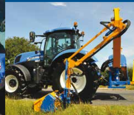
Massive 1.6m forward reach For optimum viewing position when working.