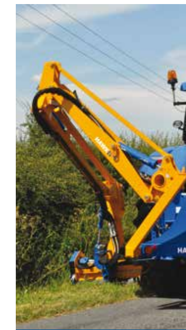
Variable Forward Arm The VFA allows total flexibility of position during arms operation.