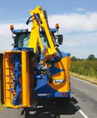
Transport bracket Supplied as standard for fast travelling on the road.