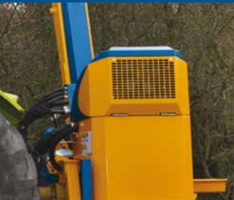
Oil cooler Standard on all models (cable controls as an option).