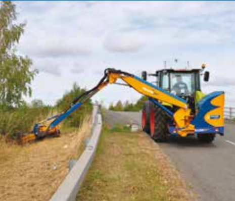
Excellent reach characteristics Enables cutting in challenging environments.