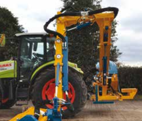
Telescopic 3rd arm on 6.0T and 6.5T models Gives increased flexibility.