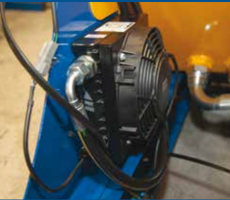
Optional oil cooler Can be fitted in rear panel.