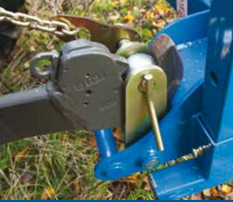
Mechanical breakout For machine and operator safety.