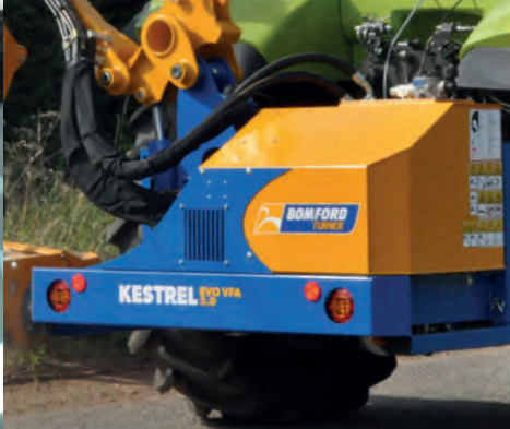
Low profile tank Aids driver visibility.