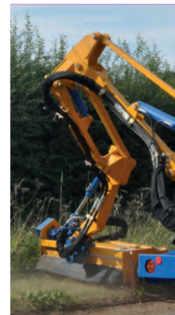
Clear visibility Variable forward reach brings cutting head into drivers view.