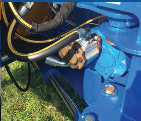
Powerful 74hp hydraulics For continuous use. Twin pumps with separate oil tank.