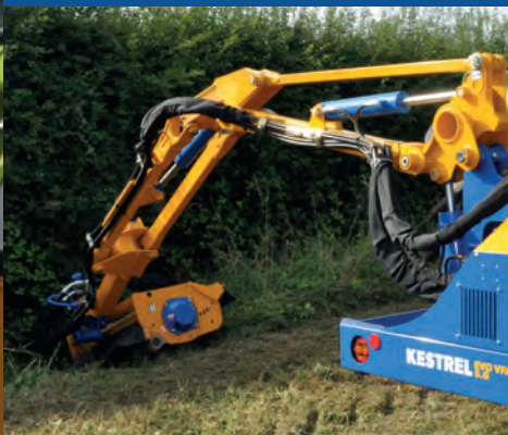
LED road lighting Fitted as standard.