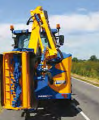
Transport bracket Supplied as standard for fast travelling on the road.