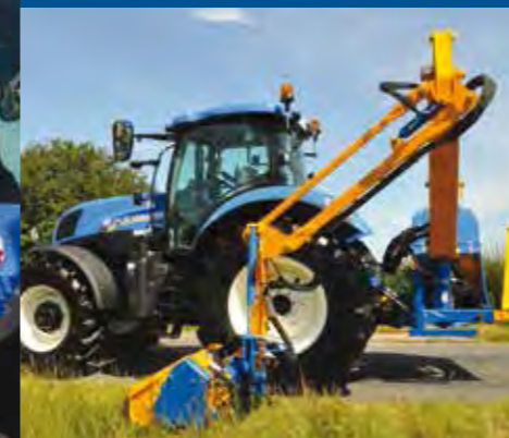
Massive 1.6m forward reach For optimum viewing position when working.