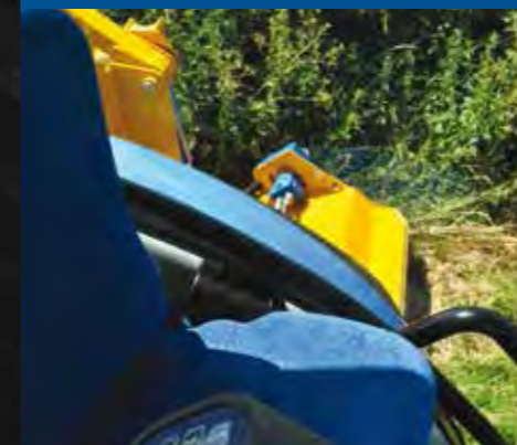
Clear visibility Variable forward reach brings cutting head into drivers view.